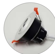
Adjustable Beam Degree